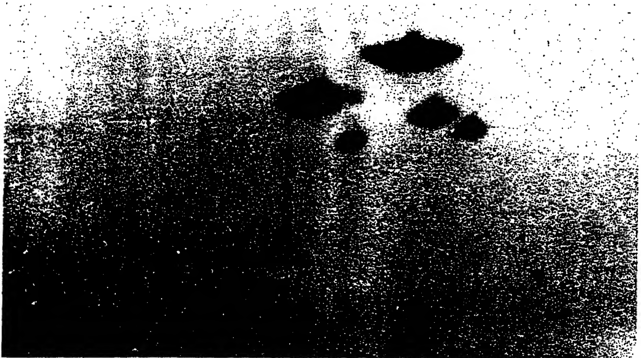
Sheffield, England, 4 March 1962